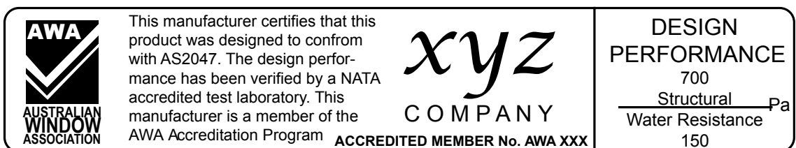
Example of labelling used by AWA Members